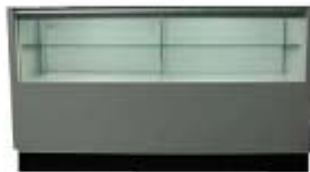
See-Thru Wall Case